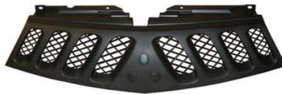
15 GRILLE FULL CP 2 DOOR