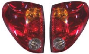
13 TAIL LAMP UNIT