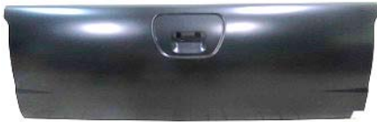
1 TAIL GATE W/O BRAKE LAMP MIDDLE OPENER 2 TAIL GATE MIDDLE OPEN WITH STOP LAMP 3 FRONT DOOR SKIN