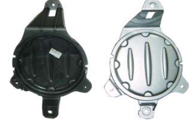
9 FOG LAMP COVER