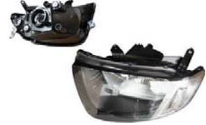
6 HEAD LAMP 2 DOOR