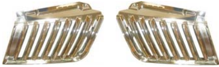
1 GRILLE ALL CP