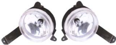
7 FOG LAMP