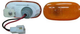
11 SIDE LAMP ASSY L+ R