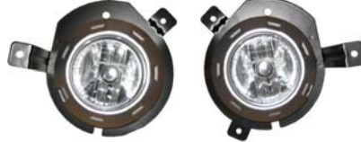
8 FOG LAMP W/SILVER RIM