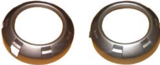
10 FOG LAMP RIM ROUND COVER