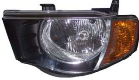
4 HEAD LAMP 4DRS UNIT AMBER