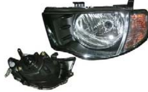
5 HEAD LAMP UNIT CLEAR