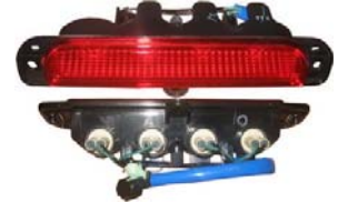
12 TAIL GATE BRAKE LAMP