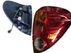
14 TAIL LAMP ASSY