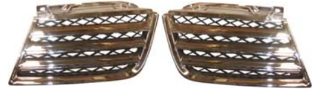
3 GRILLE SET CP/BK